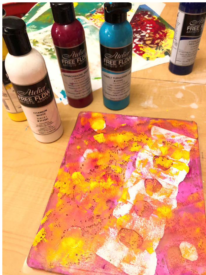
Atelier Free Flow Quinacridone Magenta, Titanium White, Arylamide Yellow Light and handmade stencils on a Gelli Plate

The first thing I did was change up my surface. I usually begin my paintings on canvas that I've primed with gesso (the coloured Atelier Free Flow Gessos have been my go-to gesso for some time) but I decided to work on a heavyweight watercolor paper. I also chose to use a Gelli Plate , which is a durable, reusable gel printing plate, most often used for monoprints. Free Flow has a nice consistency for printmaking (you don't need much paint), and I applied some colour with a brayer and added a handmade stencil onto the Gelli Plate.