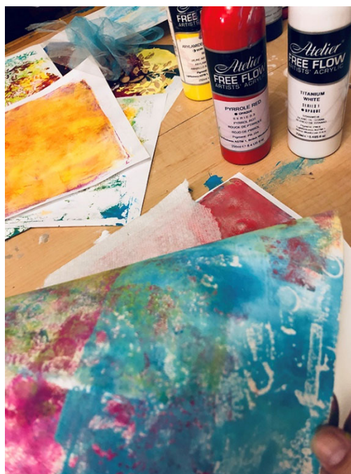
And another layer with a paper towel texture...