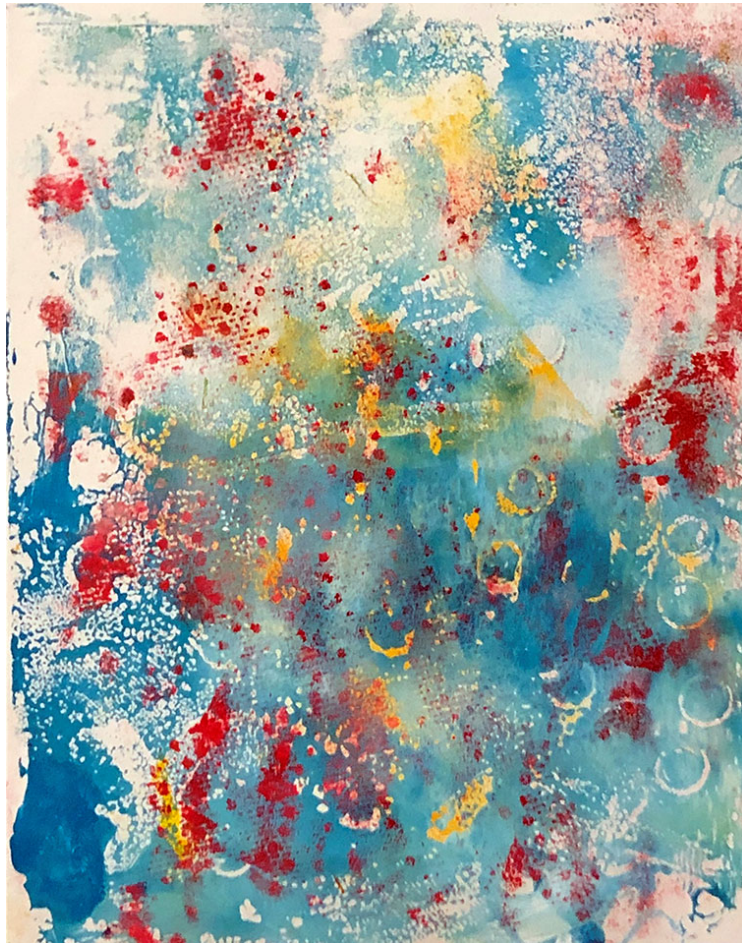
Excess Paint/Ghost Prints - you can really see the paper towel texture on this

I created textures on the plate by removing some paint with rags, netting, foam stamps, a spool of thread and bubble wrap. I even used a paper towel for the pattern and to make a soft edge stencil. I pulled excess paint and made ghost prints after each pull, creating a secondary pattern.