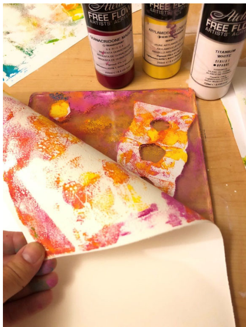
Pulling the print

Tip: If you feel you have too much paint on the plate, pull some off using scrap paper or paper from the recycling bin. I was ready to pull my 1st print.