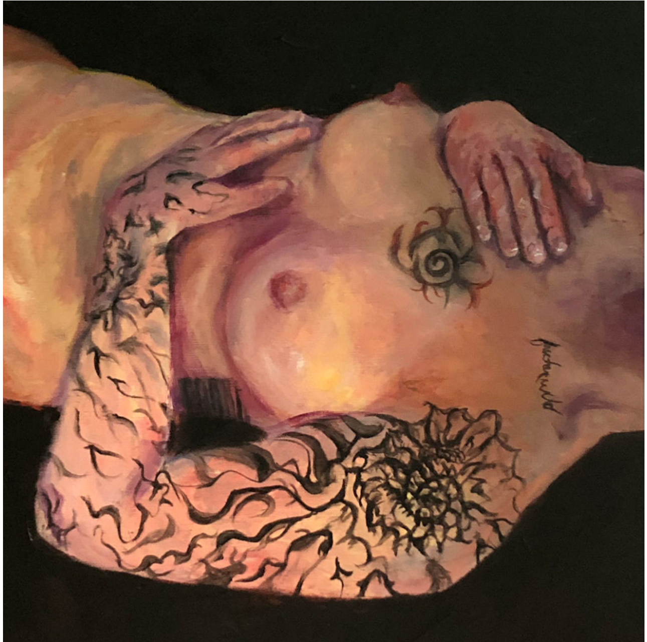
Glazing to capture subtle curves and light changes with soft shadows

Glazes allowed layers of luminous color to come through, and I was able to capture the subtle changes of light such as in the curve of the breast and face. While it was possible to capture these changing planes by painting wet-in-wet, I found that a more nuanced approach worked better in these paintings and created colors only possible through glazing.