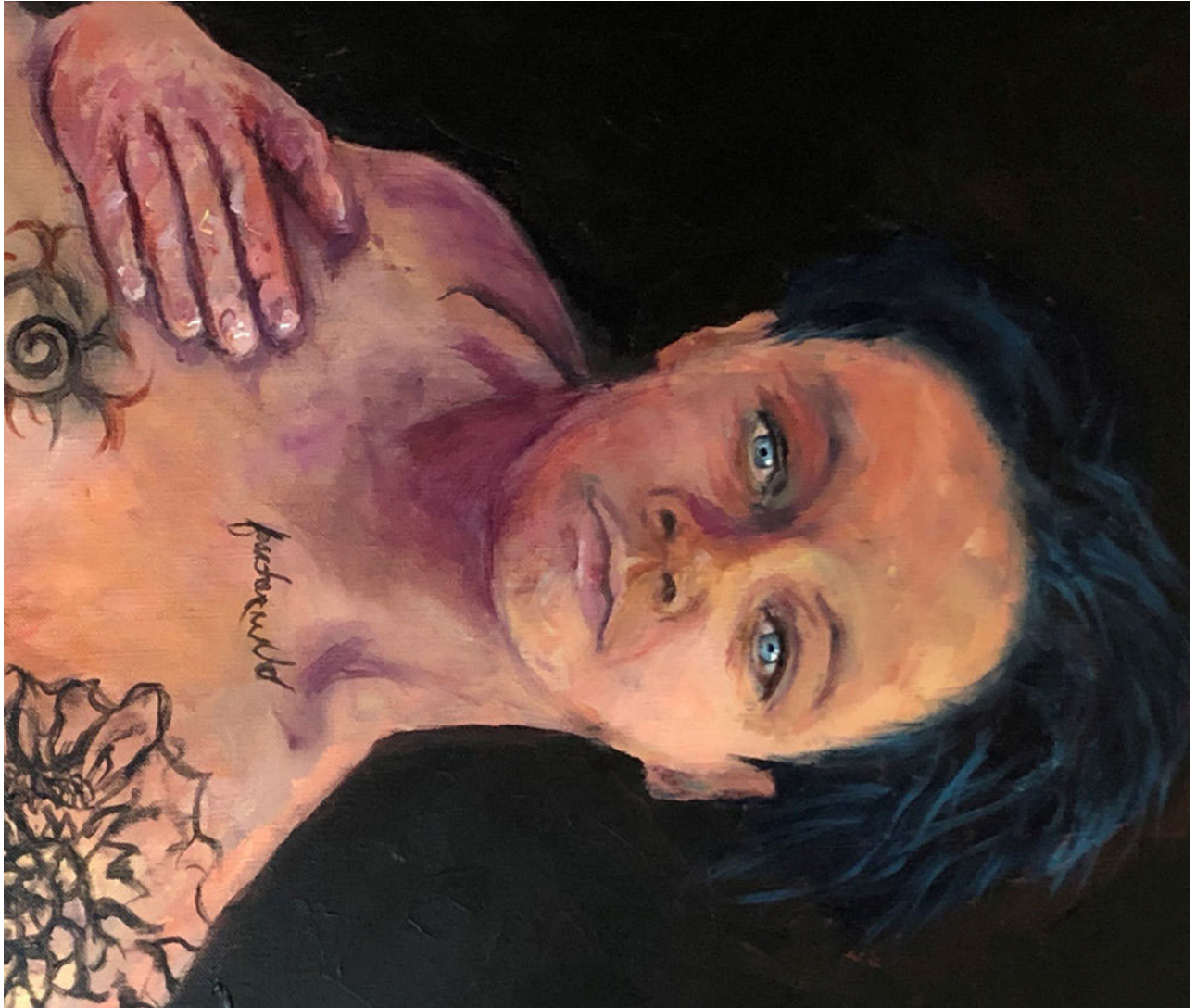
Detail of curves and colours on face and neck

Using a ratio of about 4:1 Middle Medium:Paint, I applied layer after layer of transparent or semi-transparent glazes of colours such as Permanent Alizarine, Raw Sienna Dark, Arylamide Yellow Deep, Blue Black and Naples Yellow. My standard practice is to apply a glaze and then wipe it back.