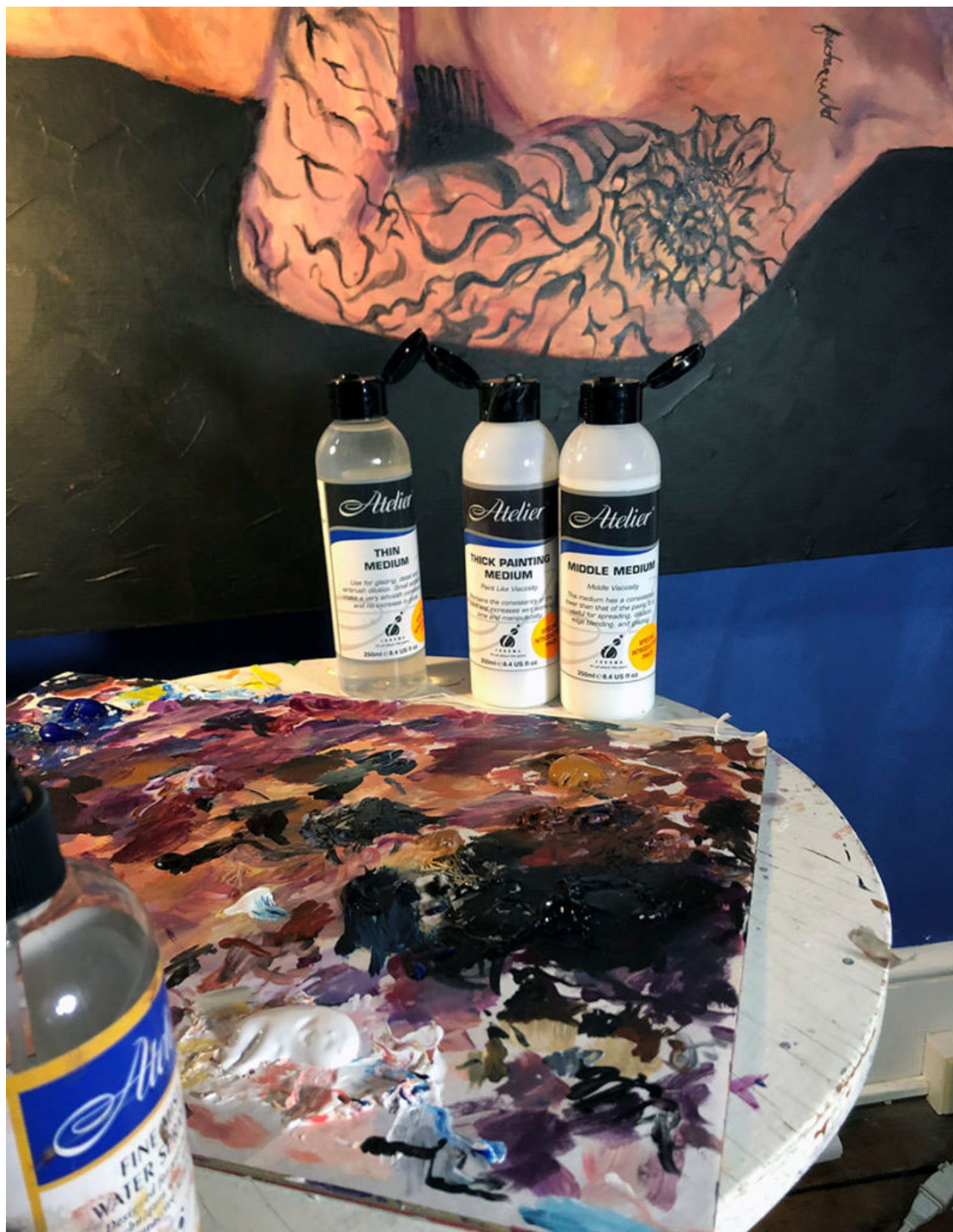
Atelier Mediums At work